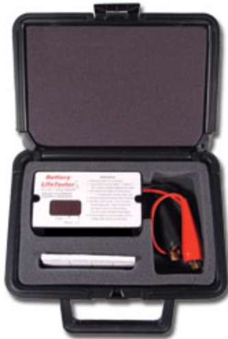
ELK-Battery Life Tester Made In USA