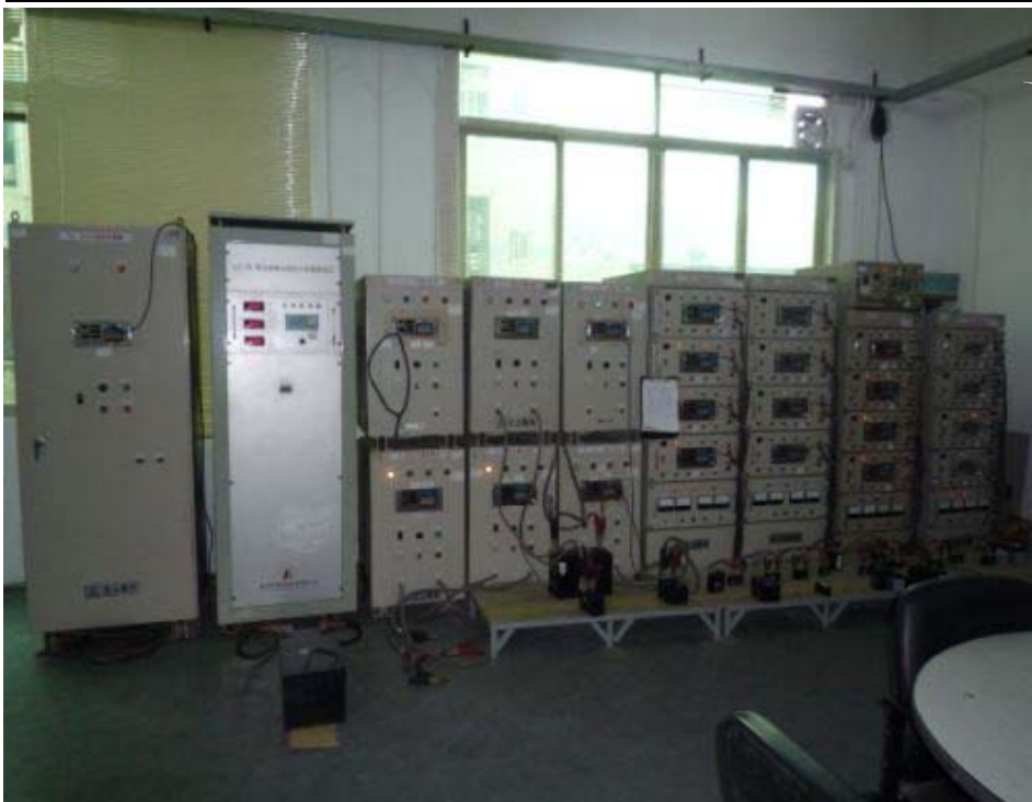
Bitrode Battery Test System Made In USA