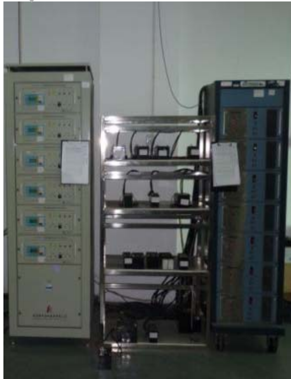
Li Shang Test System Made In Taiwan