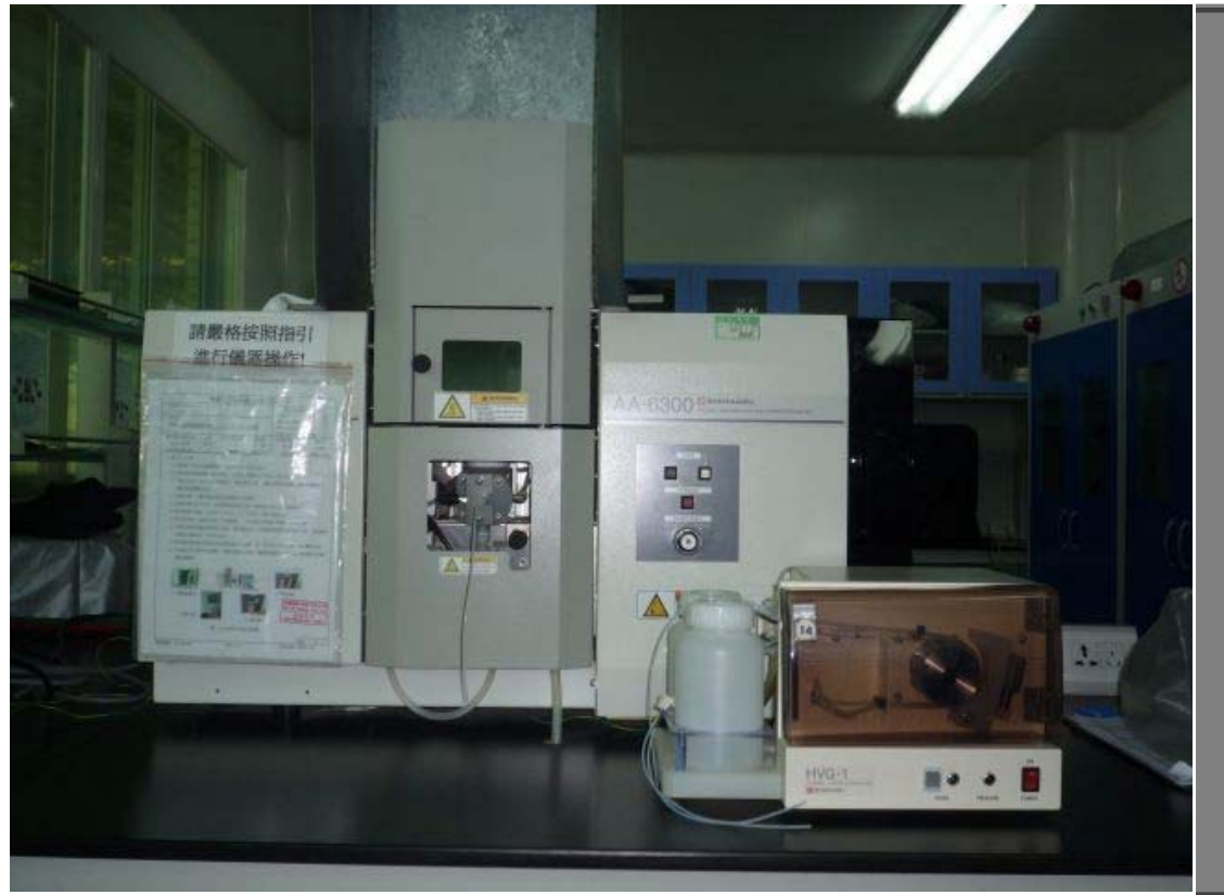
SHIMADZU –AA-6300 Atomic Absorption Spectrophotometry Made In Japan