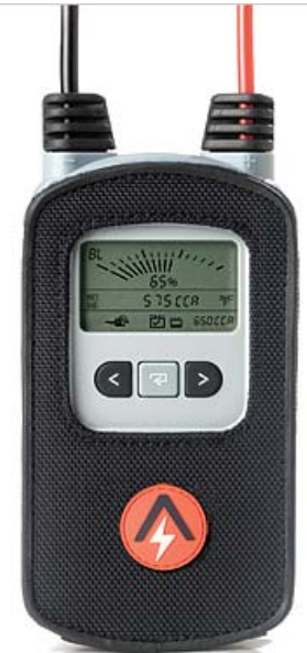
Argus-Digital Battery Analyzer AA500P Made In USA