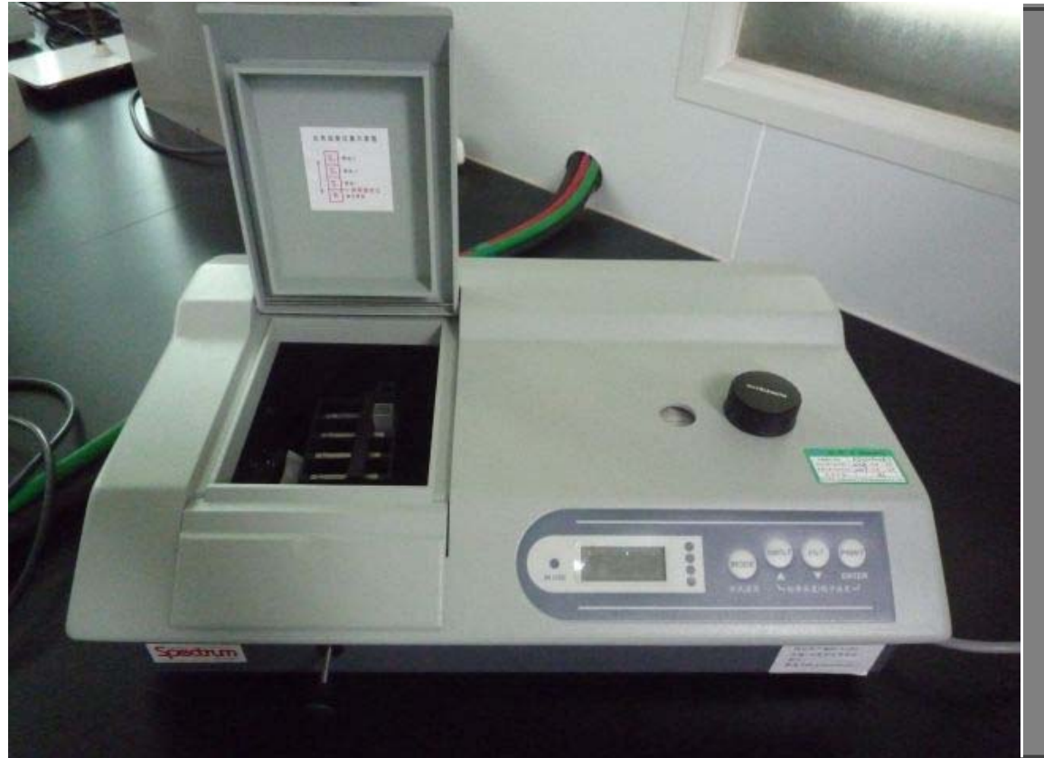
Spectrum- 722 Visible-infrared Spectrometer Made In China